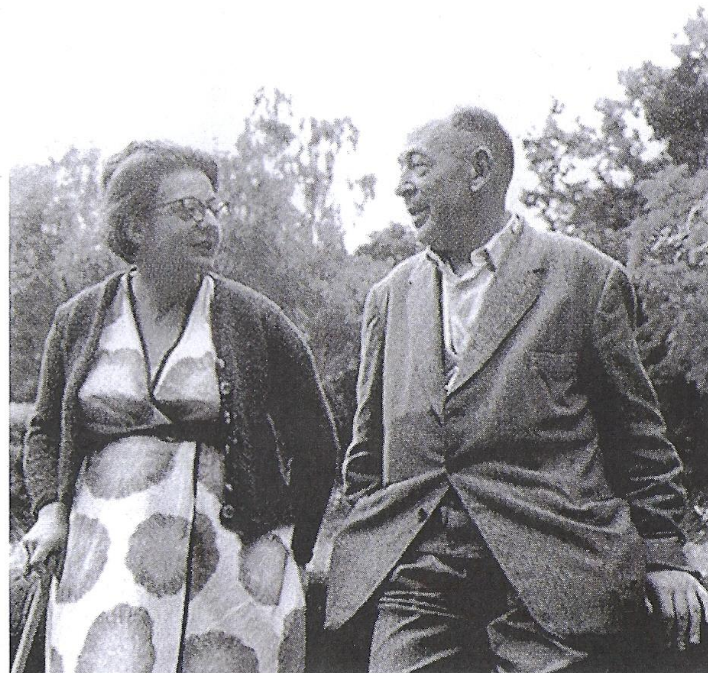
Joy Gresham and C S Lewis at The Kilns

Neither the Qafé nor the Grapevine is able to accept credit or debit cards.